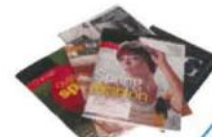
Magazines & catalogs