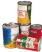
Tin or steel cans